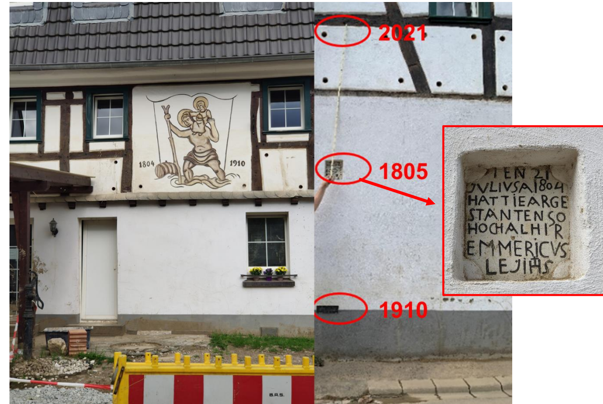
Historic flood marks in Ahr valley