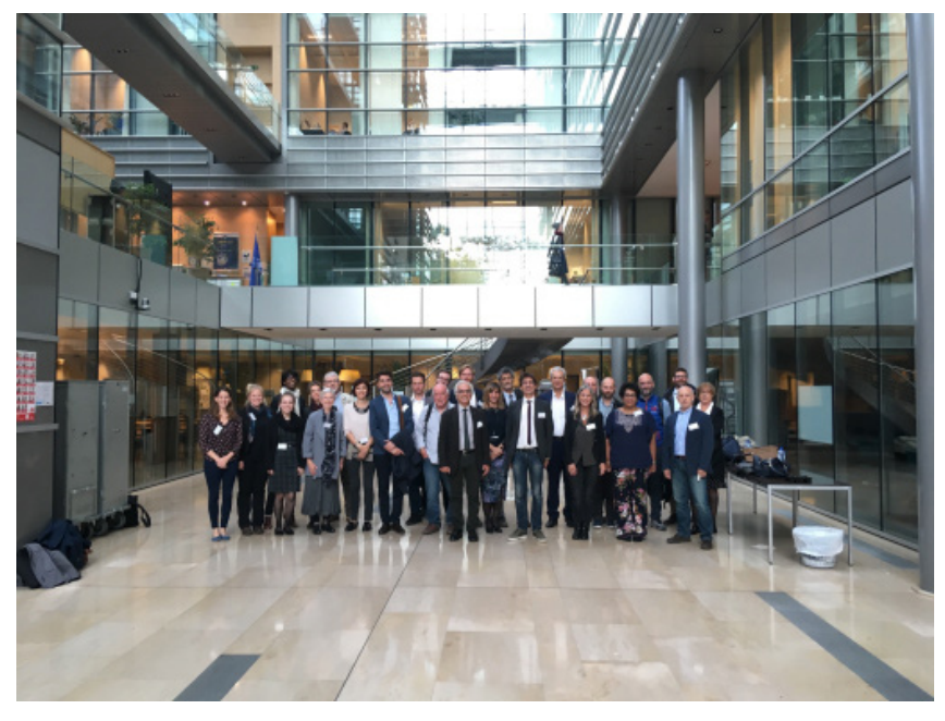
Figure 1: Participants of the final Stakeholder Forum at the European Commission

Guidelines, Vision Paper, videos and presentations from the event are now available and freely downloadable at <u>www.espressoproject.eu</u>.